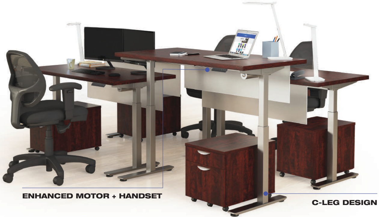
ENHANCED MOTOR + HANDSET