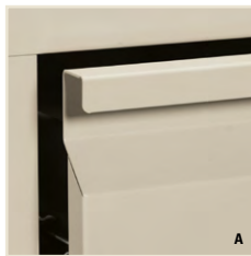
A. Recessed angled full pull

Available in Black, Designer White, Grey and Nevada with no minimum order quantity. All other standard Global file finishes are available with no upcharge with a minimum 10-piece order.