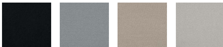
LL19 – Lola Black LL14 – Lola Blue Mist LL12 – Lola Caramel Cream LL11 – Lola Medium Taupe