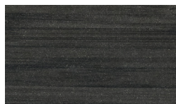
ASN Asian Night