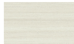
WHC White Chocolate