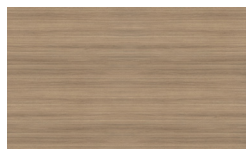
NML Noce Medio