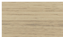
NEL Noce Leggero