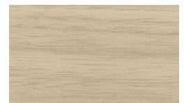
NBL Noce Biondo