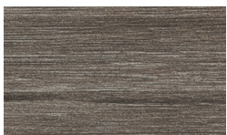
ACJ Absolute Acajou