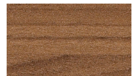
WCR Winter Cherry