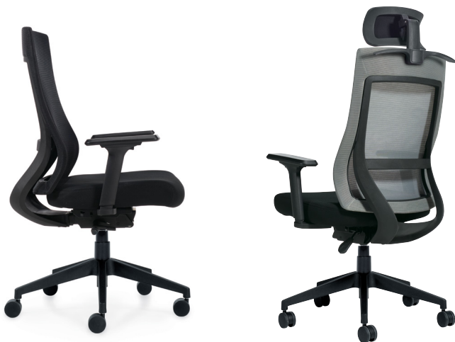
shown with optional headrest